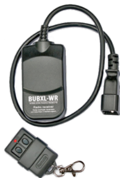
Wireless Remote SKU: BUBXL-WR